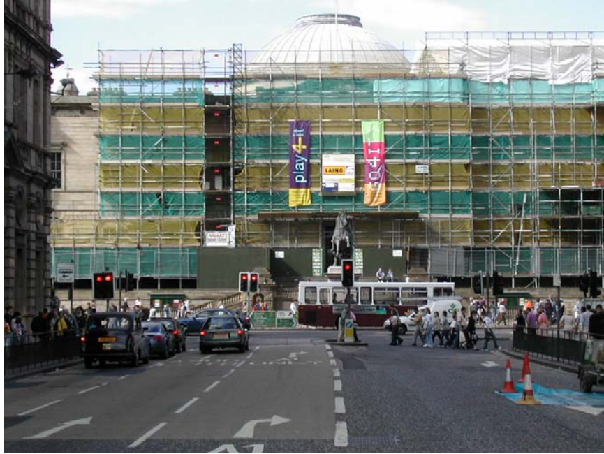
Even Register House at the bottom of North Bridge.