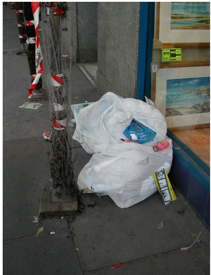
Walking up to the shops, this rubbish is seen.