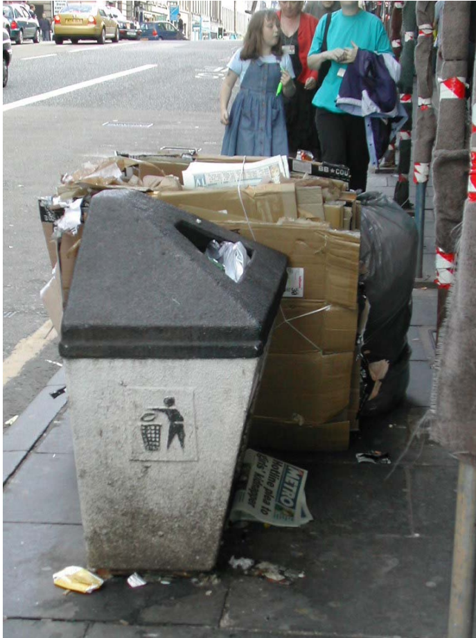
At the top of North Bridge, two points of view of the same pile of rubbish. Another bin which is filthy.