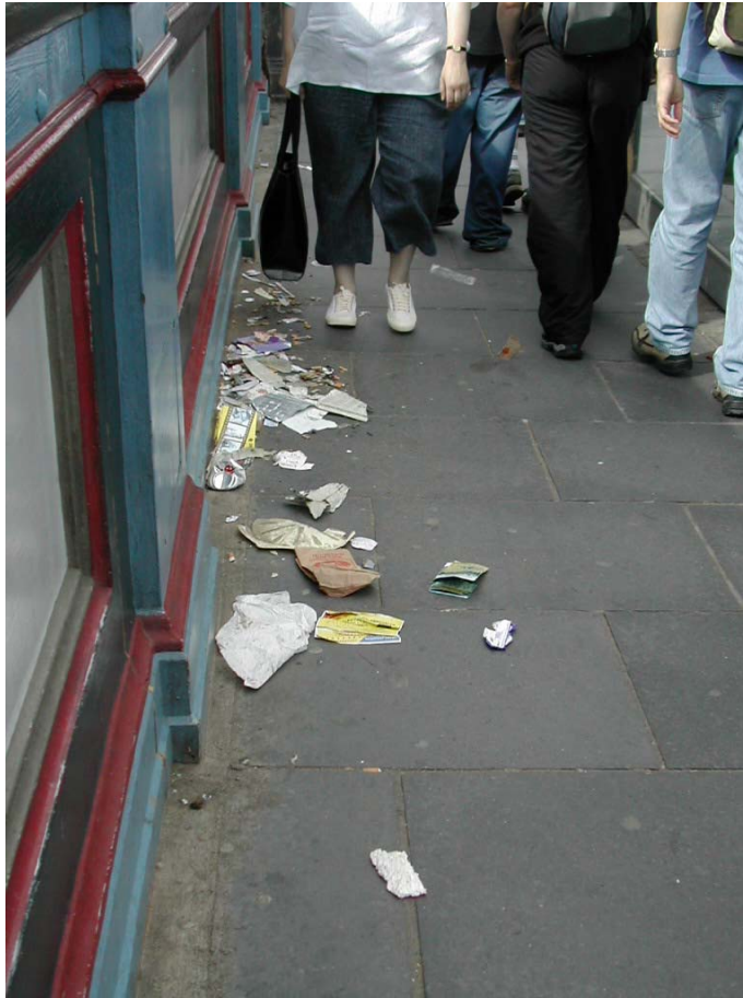
This rubbish is very close by, - just behind the bus stop.